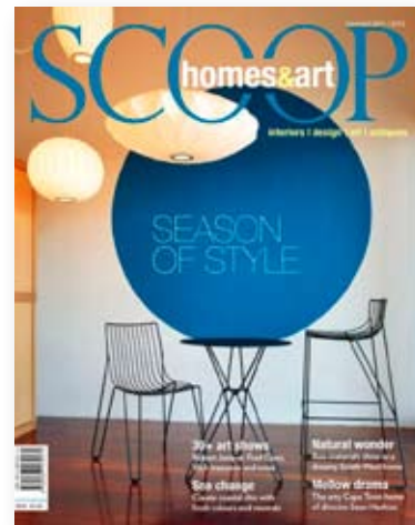
SCOOP HOMES & ART On-shelf: Mar, June, Sep, Dec