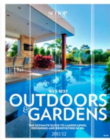
WA'S BEST OUTDOORS & GARDENS On-shelf: Sep