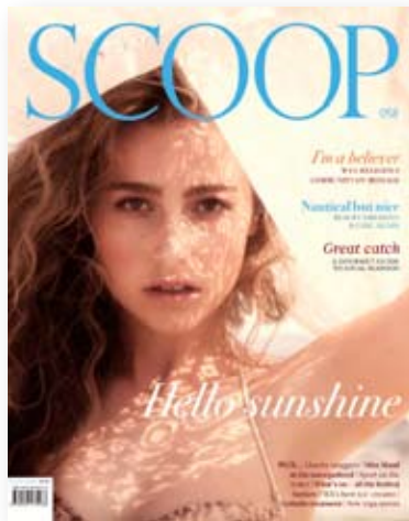
SCOOP On-shelf: Mar, June, Sep, Dec