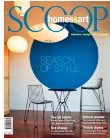
Scoop Homes & Art Quaterly: Mar, June, Sep, Dec