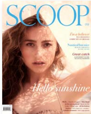
Scoop Quaterly: Mar, June, Sep, Dec