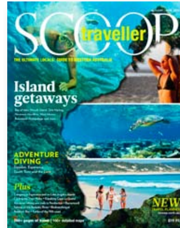
Scoop Traveller Biannual: June, Dec