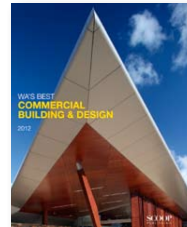
WA's Best Commercial Building & Design Annual: Feb