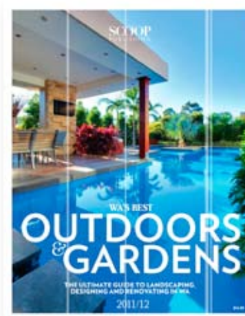
WA's Best Outdoors & Gardens Annual: Sep