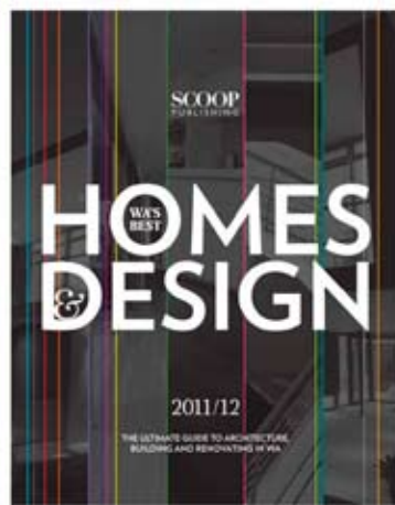
WA's Best Homes & Design Annual: Oct