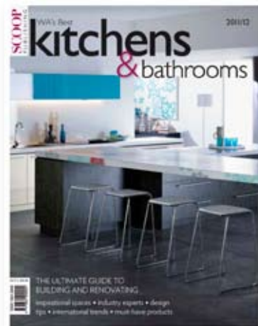
WA's Best Kitchens & Bathrooms Annual: Apr