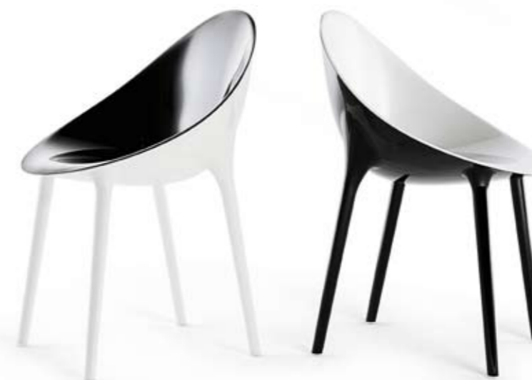
Kartell Super Impossible armchairs

Ricarda's new Kartell concept store is the talk of the town. The latest products in-store are on trend for spring with bright colours and a contemporary style. The Moon bowl, $135, (in orange, top) comes in a collection of fun colours – designed by Mario Bellini and made from synthetic material, its textured finish references the surface of the moon. The sleek design of the Super Impossible armchair, $545, designed by Philippe Starck and Eugeni Quitllet, makes it a stand-out modern design for the home. Ricarda Subiaco, 399 Hay Street, Subiaco (08) 9381 5446.