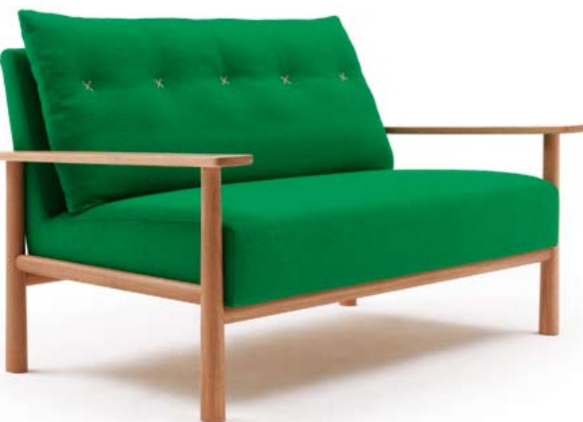
Table & Chair is the new exclusive agent for Jardan in WA. Made in Melbourne, the collection of dynamic furniture includes sofas, chairs, tables and beds. The family-owned and run company is dedicated to creating inspirational pieces of the highest quality – we love the vibrant green upholstery on the Archie sofa (pictured), POA. Table & Chair (08) 9388 1855, tableandchaircompany.com.au.