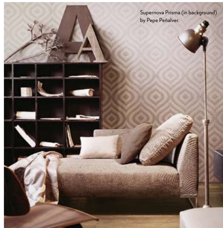
Supernova Prisma (in background) by Pepe Peñalver.