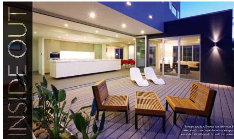
Bring the outside in. Embrace outdoor living and create beautiful spaces in your home by opening up your kitchen and bathroom to the world. www.scoop.com.au